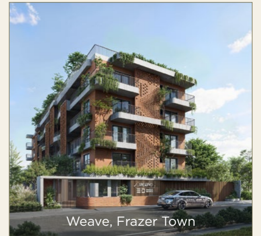
Weave, Frazer Town