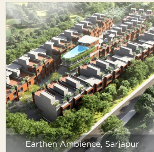
Earthen Ambience, Sarjapur